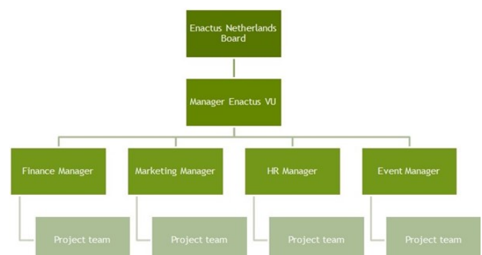
Figure 1: Illustration made by the author

To understand the structure an overview of the organization follows to draw a map on how people are connected and where to place them.