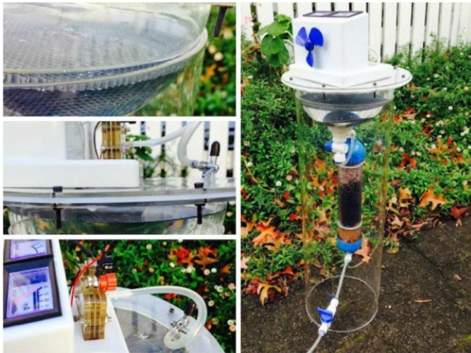
Figure 5: Prototype model “H2Pro”.

purification systems (Figure 6). It is solar powered by the solar panels on its roof and constructed from local material (except for some electronic parts), for instance bamboo, wood or recycled goods.