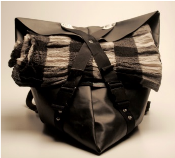
Figure 3: Fortune-cookie like bag.

materials into something useful that could be of value on the onward journeys of the refugees. Thereafter she returned to the Netherlands and designed a prototype bag together with Aaslund. Once the prototype was developed, the two designers went back to the refugee camp on the Greek island Lesbos in March 2016 and started workshops that taught refugees to make the bags themselves. The refugees enjoyed the crafting process and started to teach others how to make the bags. The design project became such a success that “BAG2WORK” was then nominated for a New Material Award and exhibited at the Dutch Design Week in 2016. However, the implementation of the Kickstarter project of “BAG2WORK”, which was eventually supposed to create work for newly settled refugees in Amsterdam, failed to reach its funding goal and was thus never realized (No Mad Makers, 2016).