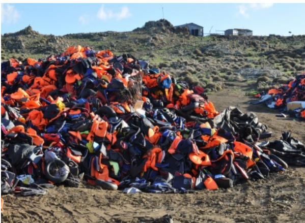
Figure 4: Discarded life vests and rubber