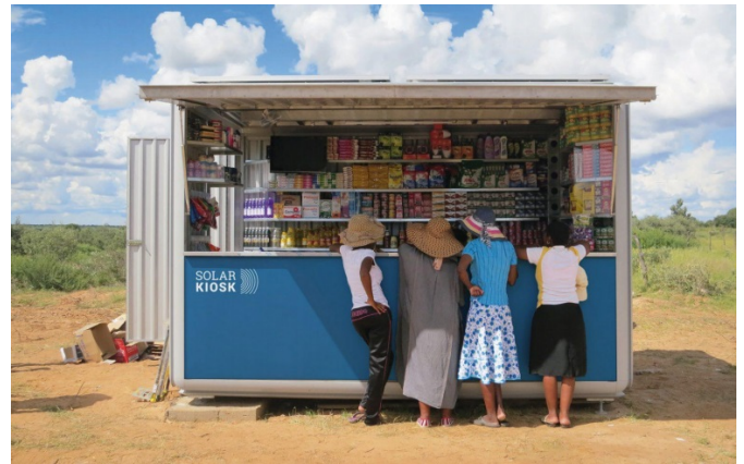
Figure 6: SolarKiosk in Botswana.