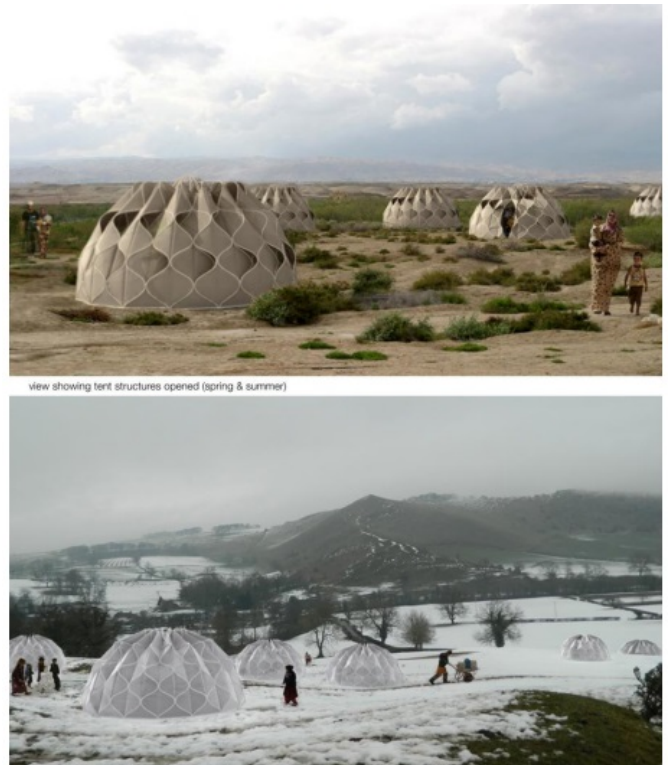
Figure 2: Views of “Weaving a Home” in Summer and Winter.

The Design project “BAG2WORK” has targeted this issue in creative ways as it converts the discarded materials into fortune-cookie like bags (Figure 3). The design is simple and the material consists only of 1 square meter of boat rubber, 4 life vest straps that function at shoulder straps and 35 rivets and rings to close the bag. The rubber and life vest materials are functional, as they are highly durable and waterproof. Moreover, the design accomplished to create a bag balancing maximum capacity of 21-Liter with a minimum amount of material. What stands