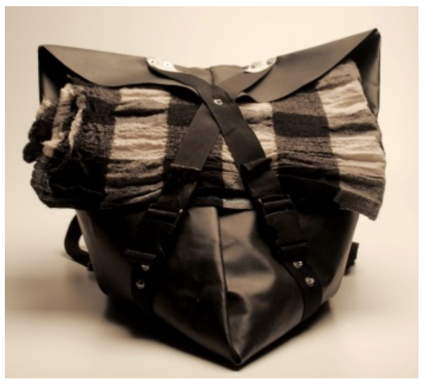
Figure 3: Fortune-cookie like bag. Retrieved March 29<sup>th</sup> 2019 from Dezeen.com

terials into something useful that could be of value on the onward journeys of the refugees. Thereafter she returned to the Netherlands and designed a prototype bag together with Aaslund. Once the prototype was developed, the two designers went back to the refugee camp on the Greek island Lesbos in March 2016 and started workshops that taught refugees to make the bags themselves. The refugees enjoyed the crafting process and started to teach others how to make the bags. The design project became such a success that "BAG2WORK" was then nominated for a New Material Award and exhibited at the Dutch Design Week in 2016. However, the implementation of the Kickstarter project of "BAG2WORK", which was eventually supposed to create work for newly settled refugees in Amsterdam, failed to reach its funding goal and was thus never realized (No Mad Makers, 2016).