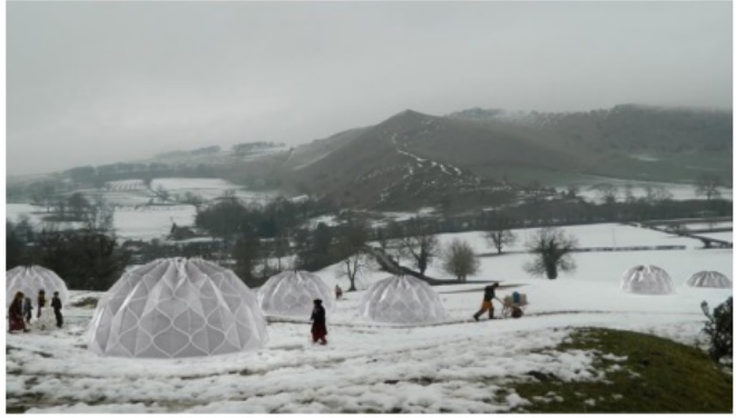
Figure 2: Views of "Weaving a Home" in Summer and Winter.

out especially about this design is that it does not require a lot of expertise to be made. The recycled bag can be handmade with rivet guns and without power tools. This is an essential feature of the design since it was created not only to upcycle the vast material left behind at the beaches of the Greek island of Lesbos, but also to empower refugees by teaching them how to make the bags themselves. The social aspect adds another implicit function to this design that is also included in the name of the project. "BAG2WORK" as in "back to work" aims to give refugees a task in their everyday life at the camp and eventually is aimed at employing resettled refugees in the Netherlands to make bags and earn money by selling them. The basic idea behind the design is to convert boats and live vests into bags and refugees into employees, which makes the design both environmentally and socially sustainable.