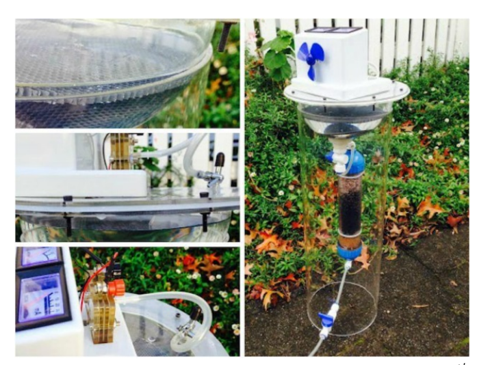
Figure 5: Prototype model "H2Pro".

purification systems (Figure 6). It is solar powered by the solar panels on its roof and constructed from local material (except for some electronic parts), for instance bamboo, wood or recycled goods.